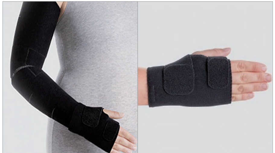
Figure 1. Juzo ACS Light Arm Wrap & Juzo ACS Light Hand Wrap (Juzo, 2021).

The Juzo Adjustable Compression System Light (JACSL) and Hand Wrap (Juzo, 2020; Figure 1) was chosen as it has an incorporated lining (fixing aid), which the company state makes the JACSL easy to use and allows for simple and quick application. This could, therefore, aid in patients’ self-management. The manufacturers claim that therapeutic compression pressures of up to 40 mmHg are possible and, therefore, effective therapeutic compression pressures