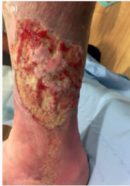
Figure 4(a) and (b): Before and after use of Prontosan Debridement Pad on a sloughy venous ulcer