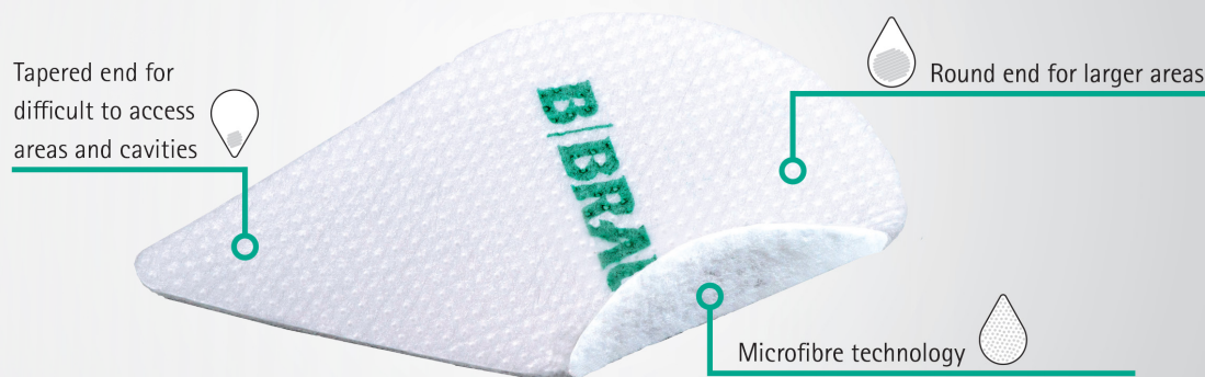
Figure 2: The Prontosan Debridement Pad

It is important to remember that, while debridement provides the foundation of healing, debridement alone will not achieve healing and must be used as part of an overall management plan involving the patient, their disease process and the wound itself (Vowden & Vowden, 2011). Chronic wounds may require repeated, or maintenance, debridement to prevent the wound reverting to a chronic unhealthy state, regardless of debridement method chosen (Wolcott, 2009) (see Figure 1).