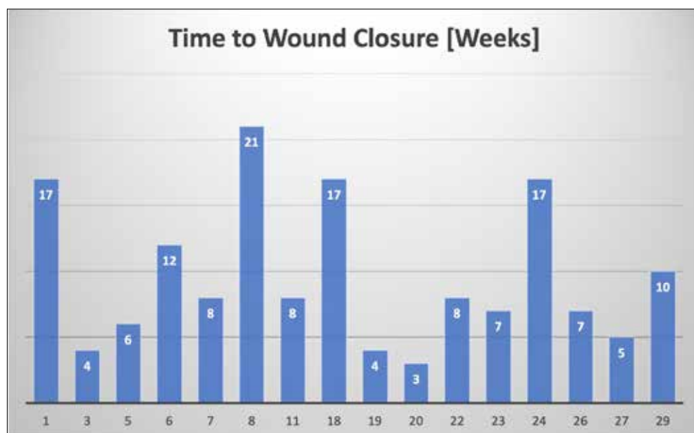
Figure 5. Time to wound closure (in weeks).

follow-up (LTFU) during the observation periods. The time between baseline and last observation varied among participants depending on the time taken for wound closure, as well as the cut off point for the observation study.