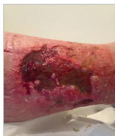
Case 1. After debridement.