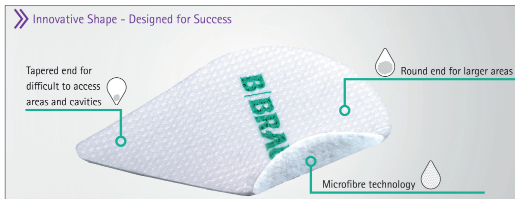
Figure 2. The Prontosan® debridement pad.

colonisation of the wound. Prontosan® solution was used as part of a wound care regimen including compression therapy. Improvement was seen after 4 and 6 weeks of treatment, with the wound going on to complete healing within 8 weeks.