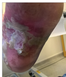
Case 2. Before debridement.