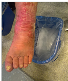
Case 2. After debridement.

As his pain and odour issues improved, the patient's mobility also benefited, which had a positive effect on his overall health. The patient was able to increase his exercise levels, then agreed to seeing a dietician, which helped to get his diabetes under control.