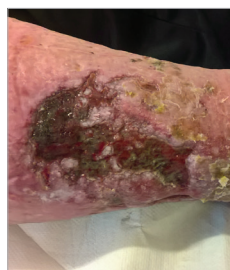
Case 1. Before debridement.

The pad is sterile and individually packed, and is intended for single use only. It should not be rinsed or reused; cut to size; used as a wound dressing; used in cases of known intolerance or allergy to one or more of the pad's components.