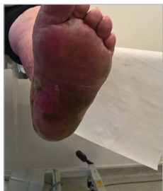
Case 2. After debridement.