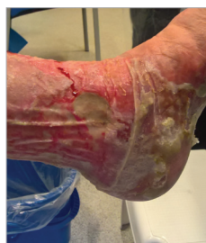
Case 2. Before debridement.