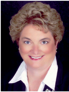
Author: Joyce Black

Pressure ulcers are defined as localised injury to the skin and/or underlying tissue, usually over a bony prominence, as a result of pressure, or pressure in conjunction with shear. An important change to this definition is the elimination of friction as a cause of pressure ulcers. Patients can develop friction injury to the heel from the constant movement of the heel on their bed linen. The change to this definition stems from an understanding that frictional forces are superficial and lead to heat in the tissues, producing serum-filled blisters; friction does not involve pressure. Shear forces — the combination of pressure and movement — can and do lead to pressure ulcers.