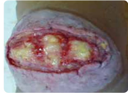
Figure 2 (left). Simulation of a fungating wound after debridement Figure 3 (right). Necrotic pressure ulcer on the heel of the foot.