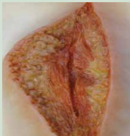
Figure 4. Dehisced abdomen with a stoma site.