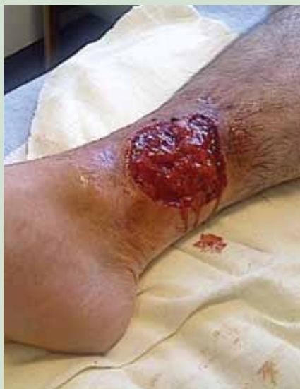
Figure 5. Simulated leg ulcer.

simulation as an opportunity for nurses to rehearse and consolidate skills prior to practice. Case studies using simulated wounds have highlighted that they can increase students' confidence, skills and decision-making capabilities [23].