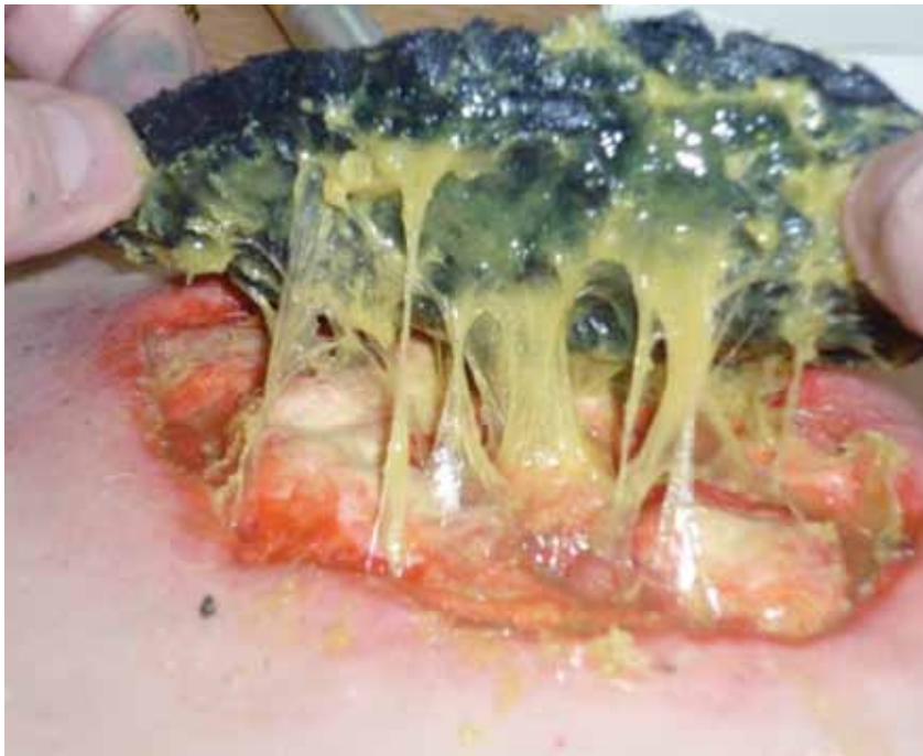
Figure 1. Debridement of a simulated pressure ulcer wound.

regular discussions with Stephens about how the wounds would look and feel. The chronic wound models produced included: