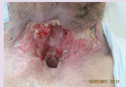
Figure 4. 15 July 2011.