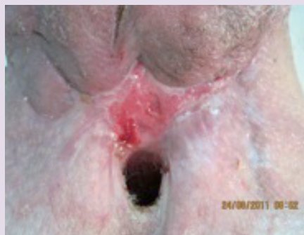
Figure 5. 24 August 2011.