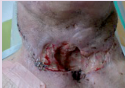
Figure 1. 7 July 2011 — supra-tracheostomy necrosis post-laryngectomy.

Tobacco and alcohol are recognised as the major risk factors for developing malignant tumours of the larynx, but others are gaining importance, such as infection with human papilloma virus (in younger patients, with higher social status) [3,4] . This is relevant as the authors believe there will be a change in the demographics of patients, who will not be as old, or educationally and economically disadvantaged as current patients.