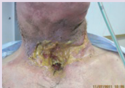
Figure 3. 11 July 2011 — the honey applied.