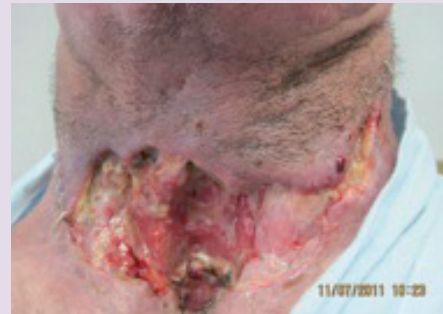
Figure 2. 11 July 2011 — start of honey treatment.