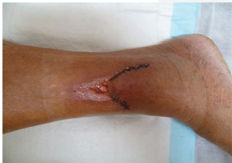
Figure 1. Wound presented at a videoconference. It was established that the debris around the skin flap was dressing-product residue, and a treatment plan was given via the videoconference to the regional nurses and rural patient.

Figure 1 was taken by the regional nurse 1 week post-surgery, before the videoconference. The image shows a swollen, dusky skin flap with debris present within the wound bed. The videoconference took place with a nurse at both sites. The author, [at the RPH site] used the photographs and wound description provided by the rural nurse to confirm the debris were dressing-product residue. Options for removing the debris included conservative fine sharp wound debridement (CFSWD) or autolytic debridement. The regional nurse stated that she was neither confident nor skilled in CFSWD, so options for achieving autolytic debridement were discussed and a hydrocolloid dressing decided on. The author also stressed the importance of good wound cleansing and skin hygiene.