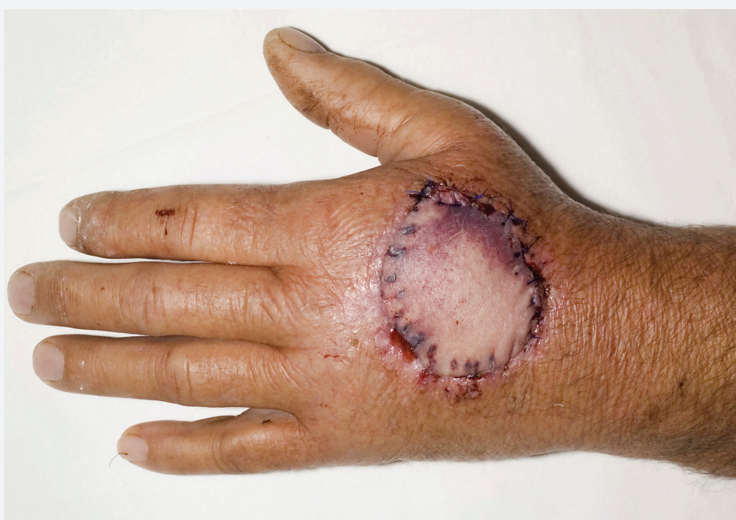
Figure 4. Videoconferencing and digital photography were used to monitor wound healing after flap division to allow the patient to be discharged to his rural home.

The wound image also showed swelling in the foot and ankle. The interactive nature of videoconferencing allowed the nurses and Mr A to discuss treatment options to reduce the swelling that would be compatible with Mr A's lifestyle. Consideration was given to: