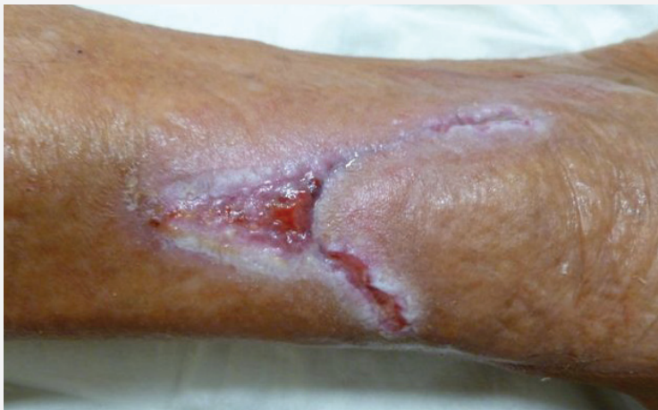
Figure 2. Wound 2 weeks after surgery showing healing progression; the rural nurse confirmed that the maceration seen here went on to resolve.