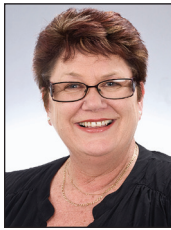
Author: Beth Sperring

This article examines the use of telehealth in rural Western Australia. The author provides case studies to explain how clinicians use photography, secured communication and videoconferencing to advise on treatment plans and monitor care pathways. Thus telehealth supports staff working in remote sites and enables expert wound care to be provided to patients no matter how rural their location.