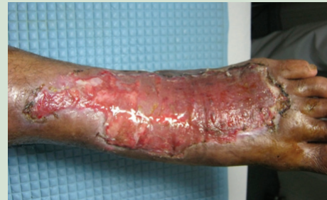
Figure 1d. Improved wound post-skin graft after 2.5 months of treatment and adjunctive therapy.