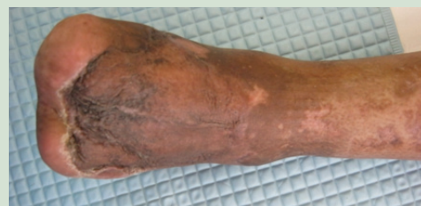
Figure 2d. The wound was completely healed after 3 months.