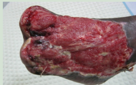
Figure 2b. Transmetatarsal amputation was performed, and granulation was observed after five sessions of HBOT.