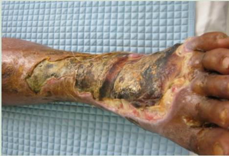
Figure 1a. Diabetic foot ulcer (Wagner grade 3), which had been a non-healing wound for 2.5 months. There was a black, hard covering on the wound site with foul, purulent discharge oozing from the wound.