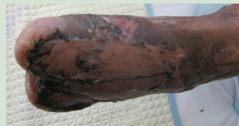
Figure 2c. Three weeks after skin graft and 10 sessions of HBOT.