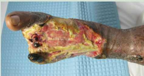
Figure 2a. A diabetic foot ulcer (Wagner grade 4), which had not healed for 3 months; necrosis and slough were noted.