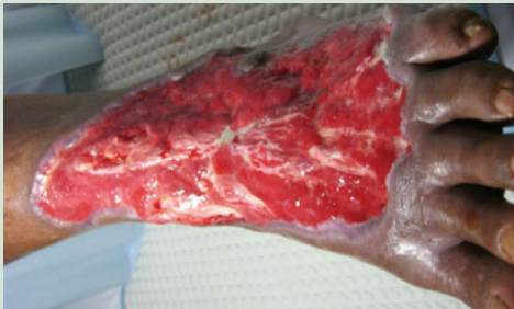
Figure 1c. Two weeks after 10 sessions of HBOT, with autolytic debridement and daily dressing changes, granulation and epithelialisation were observed.