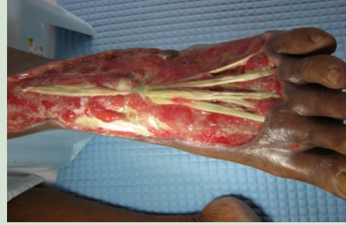
Figure 1b. Surgical debridement was performed and the dressing changed daily; a broad-spectrum antibiotic was given, and granulation was noted after five sessions of hyperbaric oxygen therapy (HBOT).