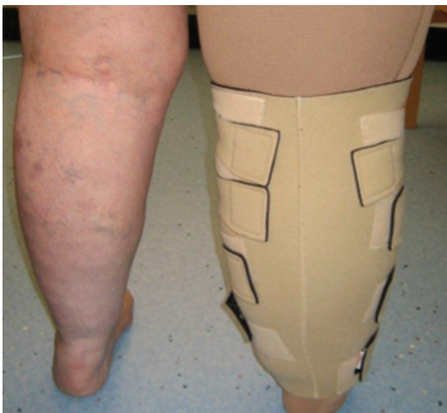
Figure 4. Back view of the device, the Velcro bands can be individually re-adjusted for optimum comfort for the wearer.