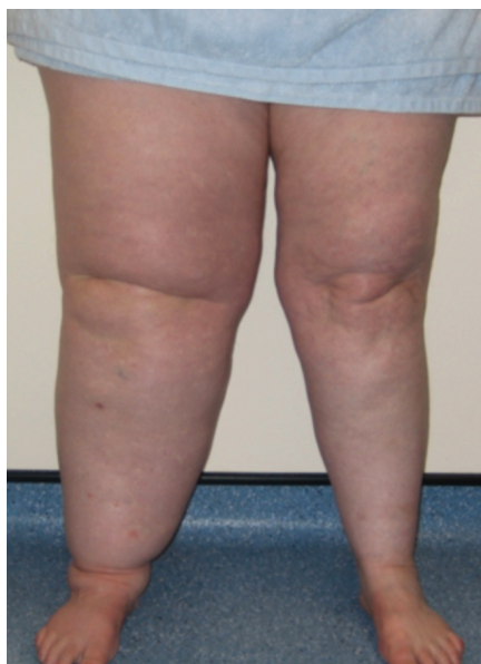
Figure 2. Excess volume of 70% compared to contralateral limb.