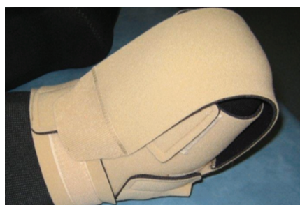
Figure 8. Juxta-Fit ankle footwrap with shelf strap in situ.

the Juxta-Fit legging to chase the oedema out of the ankle area.