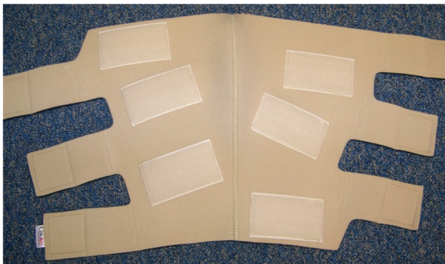
Figure 1. Juxta-Fit interlocking system.

patients and/or carers as the device can be easily readjusted throughout the day without having to undo the entire garment, thereby promoting self-management. The more a patient is able to readjust throughout the day, the greater the volume loss in the limb, resulting in improved patient outcomes and quality of life.