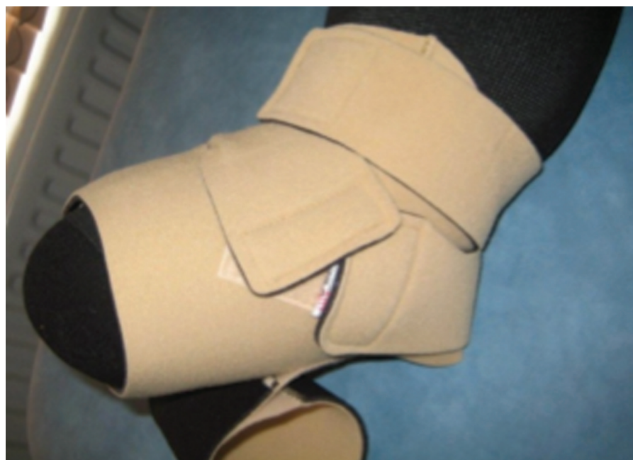
Figure 7. Juxta-Fit ankle footwrap with shelf strap anchored at the plantar aspect.

Due to the removal of fluid from this distal point, where the device ends, swelling had begun to accumulate, as predicted. However, Ms B was so delighted with the positive effects of the foot wrap, that she was happy to wear