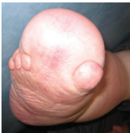
Figure 6. Distorted foot shape.

Her foot was measured, and she fitted easily into an 'off-the-shelf' medium-sized foot wrap (Figure 7). This was trialled on the right foot.