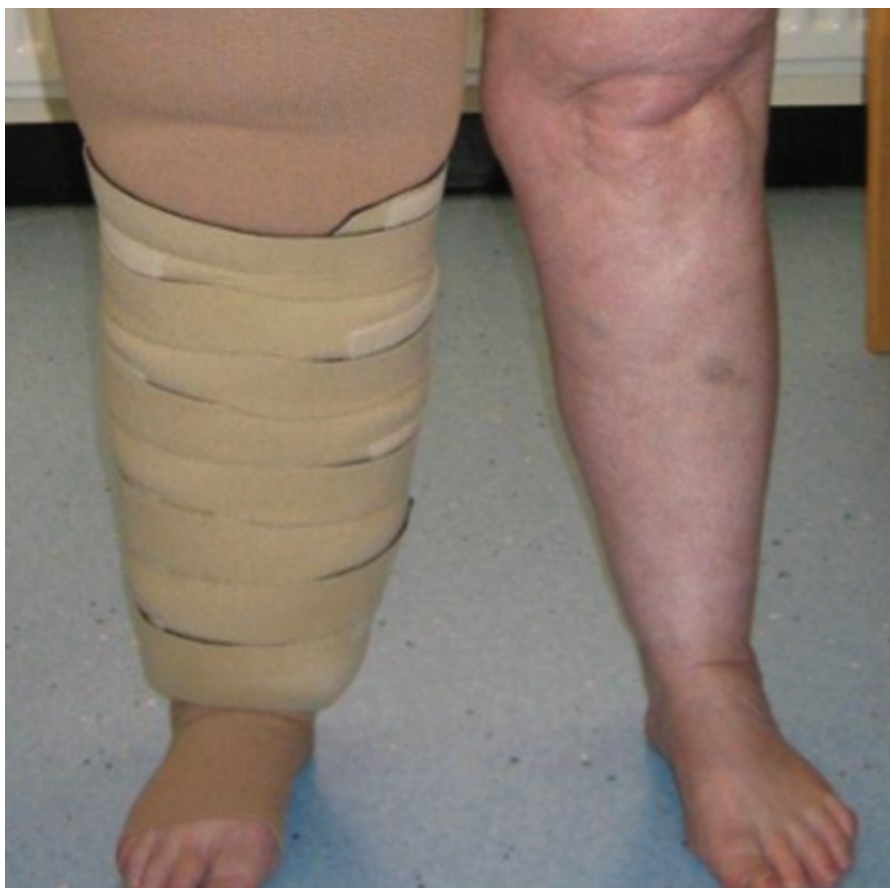
Figure 3. Lymphoedematous limb with Juxta-Fit applied.

Overall, Mrs A had lost 3870ml of fluid from her swollen limb in three months with the introduction of the Juxta-Fit.