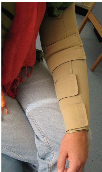
Figure 9. Juxta-armsleeve.

The lateral forearm oedema was softer and she was fitted with a class 3 made-to-measure garment. She was also provided with a Juxta-Fit armsleeve and advised to wear it as much as possible in place of the compression garment (Figure 9).