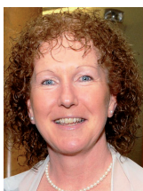
Author: Zena Moore

The cost-effective, efficient management of individuals with wounds is a key factor in providing quality wound management services. Whereas this espoused principle may seem relatively straightforward, in reality it is not. A lack of evidence to support dressing use, along with a lack of sustained availability of the right dressing for the right patient, often means