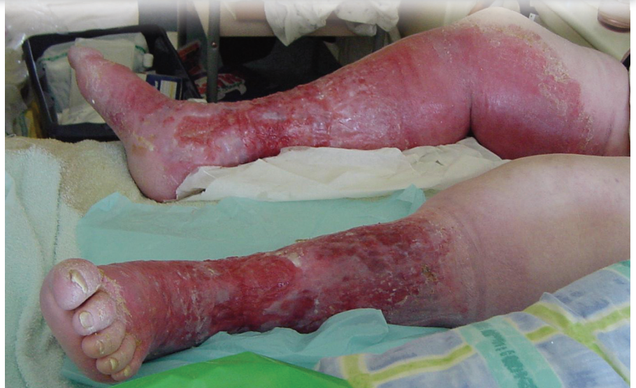
Figure 1. Extensive, spreading wet and dry cellulitis.

Cellulitis is a frequently diagnosed bacterial infection of the skin that usually presents initially as inflammation. Inflammation