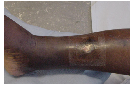
Figure 2. A swollen, hot limb has symptoms of cellulitis, but in patients with darker skin, it is sometimes difficult or impossible to identify a demarcation line or redness.