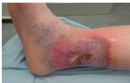
Figure 6. Venous disease with staining.