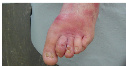
Figure 4. Trauma to toes resulting in cellulitis.