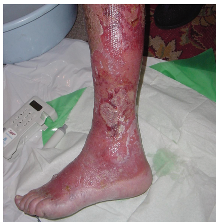
Figure 3. Ascending cellulitis with toes acting as portal of bacterial entry.