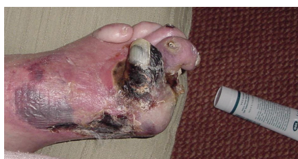
Figure 5. Arterial disease with compromised arterial circulation.