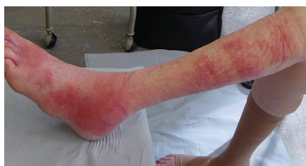
Figure 7. Contact dermatitis with clear line from allergy to bandaging.

Over time, the area of painful redness tends to expand (dry cellulitis) as the infection and resulting tissue damage spreads rapidly (Figure 5), particularly if not promptly treated. Small red dots may appear on top of the dry cellulitis, and less commonly, small blisters may form and burst (wet cellulitis).