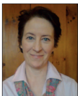
Author: Samantha Connolly

In recent years, more attention is being paid to the hormonal aspect of lipoedema. There are suggestions that lipoedema patients may have particular imbalances or sensitivities with regard to oestrogens and/or progesterone. This article examines the specifics of gluteofemoral fat storage during pregnancy: increased gluteofemoral storage with strong resistance to lipolysis. It then asks if hormonal dysregulation in lipoedema patients could result in a hormonal profile that mimics pregnancy. Such a profile may include high levels of oestrogens, progesterone, prolactin and relaxin, or any combination of the above. This pseudopregnancy hormonal profile would instruct the body to store gluteofemoral fat and strongly resist all attempts to mobilise it.