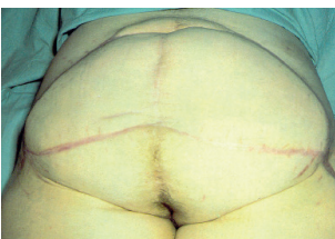
Figure 3. Healed surgical wound.

is not a candidate for the flap procedure. Flap reconstruction requires that the patient remains in bed until the flap is healed and can tolerate pressure (see details below). The patient must be taught to avoid or modify the activity that caused the pressure ulcer in the first place — frequently this involves a lifestyle change the patient must be willing to make or the ulcer will recur. There are a finite number of flaps, so it is important that each flap be used with caution.