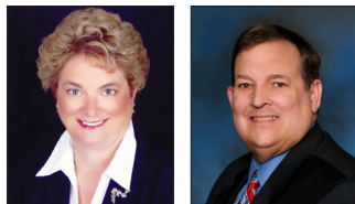
Author: Joyce Black, Steven Black

P ressure ulcers are estimated to be present in more than one-third of patients with spinal cord injury (McKinley et al, 1999). Flap reconstruction of a pressure injury is aimed at improvement of patient hygiene and appearance, prevention or resolution of osteomyelitis and sepsis, reduction of fluid and protein loss through the wound, and prevention of future malignancy (Marjolin ulcer). In general, stage 3 and 4 pressure injuries tend to require flap reconstruction. The rate of recurrence after flap surgery over past 50 years has ranged between 3% and 82%, with no trend toward improvement. Wound dehiscence is the most common surgical complication following flap reconstruction, with recurrence rates as high as 80% in some series. In a retrospective chart review of 276 patients with flaps, the predictors for pressure ulcer recurrence on the ischium were low body weight and active smoking. Wound infection was seen in patients with diabetes and osteomyelitis (Bamba et al, 2017). This paper is focused on how to improve outcomes in patients with pressure injury/ulcer who require reconstruction with a flap.