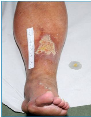
Figure 2. Initial assessment (Baseline).