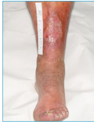
Figure 4. Week 2 review.