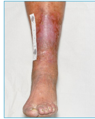
Figure 5. Week 3 review.