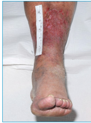
Figure 3. Week 1 review.