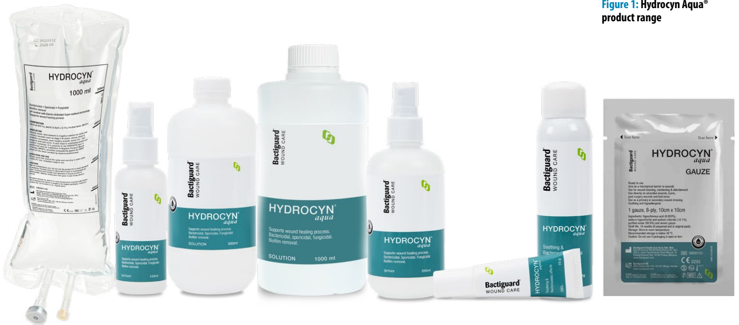
Figure 1: Hydrocyn Aqua® product range