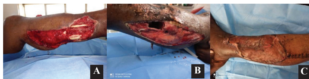
(A) Trauma wound at the beginning of NPWT therapy; (B) Trauma wound after 1st NPWT therapy session; (C) Image of grafted wound.

observe that the average Bates-Jensen score significantly reduced after the first session of NPWT therapy (32.59 versus 23.5; n=22 , ***P<0.001 ; Figure 3 ), indicating that NPWT sessions given to patients improved wound healing and wound health. The reduction in the average Bates-Jensen score for 22 patients shows that wounds moved from “moderate severity” to “mild severity” group. All patients given NPWT therapy showed a decline in Bates-Jensen score [ Table 3 ], an indicating that NPWT is therapeutically effective in improving wound