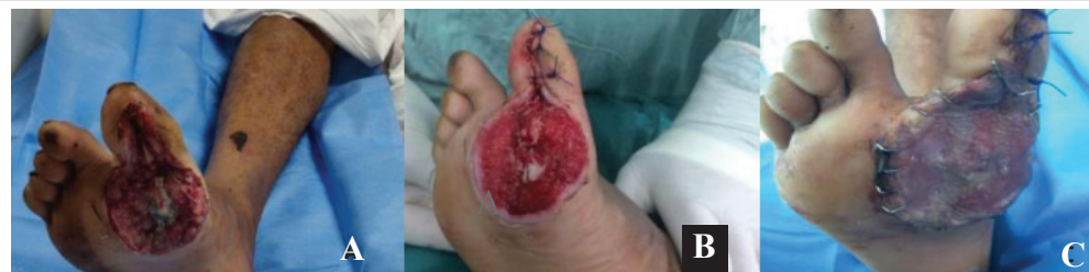
(A) Wound at the beginning of NPWT therapy; (B) Wound after 1st NPWT therapy session; (C) Grafted wound.