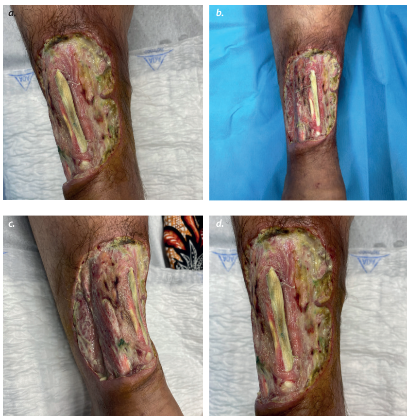
Figure 1. (A-D) Anterior, lateral and medial views of leg ulcer on hospital admission.