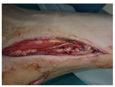
Figure 1. Baseline

For this individual with stalled non-healing wounds, the use of PROMOGRAN Matrix had helped to reduce the size of the wounds and improve the wound bed composition, moving these wounds onto a healing trajectory. The patient rated the comfort of the combined dressing regimen of PROMOGRAN Matrix and ADAPTIC TOUCH Dressing during wear time as 'excellent', and both clinician and patient were highly satisfied with the treatment. The combined dressing regimen with antibiotic therapy helped improve to the quality of life of the patient because the wound improved faster, and fewer dressing changes were required compared to the previous dressing regimen.