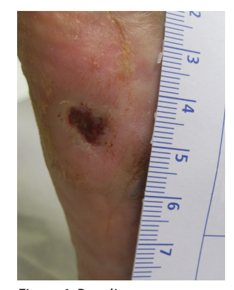
Figure 1. Baseline

Throughout treatment, the SILVERCEL Dressing was easy to use and conformed well to the wound bed. Following this regimen, the patient was moved on to standard wound care.