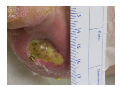
Figure 2. Review 1