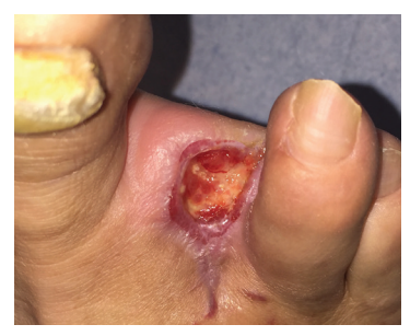
Figure 1. Baseline

Due to the wound improvement, it was prepared as before and the treatment regimen continued with TIELLE ESSENTIAL Silicone Border Dressing with changes twice a week and use of a post-surgical shoe for offloading.