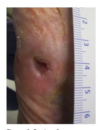
Figure 2. Review 3