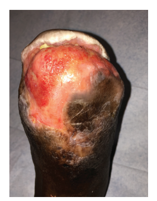
Figure 4. Review 3