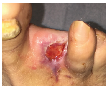
Figure 2. Review 1