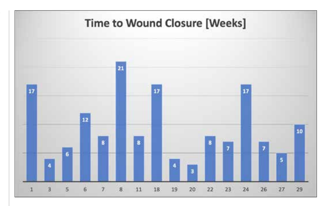
Figure 5. Time to wound closure (in weeks).

follow-up (LTFU) during the observation periods. The time between baseline and last observation varied among participants depending on the time taken for wound closure, as well as the cut off point for the observation study.