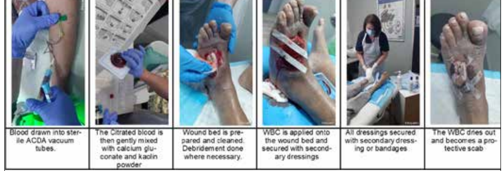
Whole Blood Clot application procedure using Actigraft RedDress kit