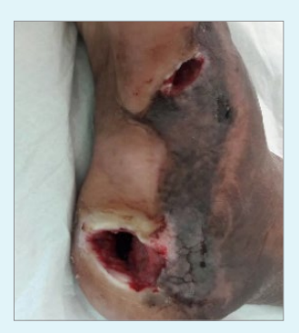
Figure 4. Initial assessment