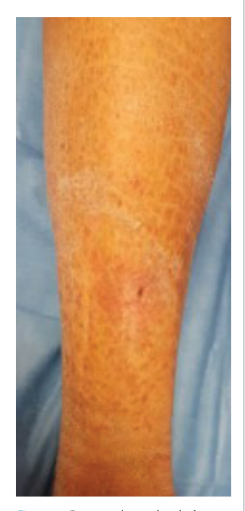
Figure 5. Day 65 almost healed – Natrox therapy discontinued.

owing to his involvement in the day-to-day management of the device. The ODS was applied directly on the wound bed, however, due to the high levels of exudate and the inability of the patient to tolerate compression bandaging, a nonadhesive polyurethane foam was used to cover the ODS, secured with a film dressing, and tubular bandage, the foam dressing helped to protect the periwound skin from maceration.