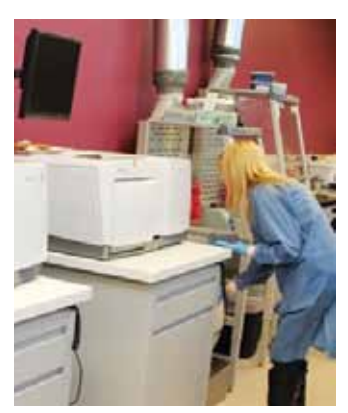
Figure 1: Sequencing instruments in a dedicated analysis room.

molecular diagnostics uncovered several interesting findings. The clinical cultures were processed by a highvolume clinical lab, which routinely evaluated wound samples. The molecular methods included real-time polymerase chain reaction (PCR) — the use of a specific primer to identify an organism — combined with pyrosequencing — a