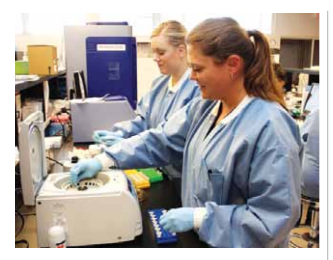
Figure 2: Extracting microbial DNA for analysis from wound samples.

method used to determine the DNA code (adenine, thymine, cytosine and guanine) for a specific gene.