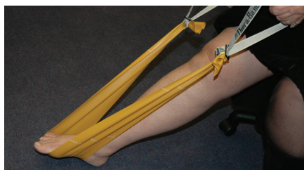
Figure 2. Plantar flexion using the Thera-Band.