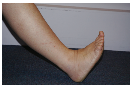
Figure 3. Dorsiflexion exercise.

0.006) to bring it to a mean of 27.2°. For the six remaining subjects who continued to 24 weeks, there was a mean change from baseline of 7.6° which translated into a mean ankle ROM of 27.1°. ( P = 0.011 ). The patients who had the worst mobility were found to have gained the most: the three worst-off patients had only 8–12° of ankle ROM when screened and progressed to 21–26° at week 12, an average gain of 13.7°.