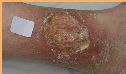
Figure 6. Slough is present on the wound bed before application of dressing.