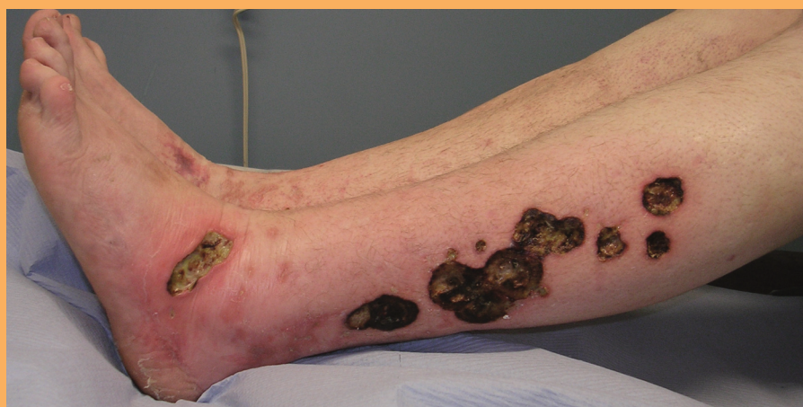
Figure 4. Vasculitis.