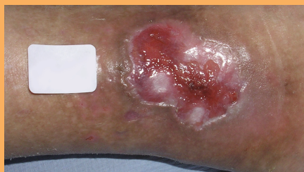
Figure 9. Once debridement has occurred, the dressing can be continued to promote granulation.

should not be used on a dry sloughy wound as they will further dry out the tissue, making it more adherent and painful.