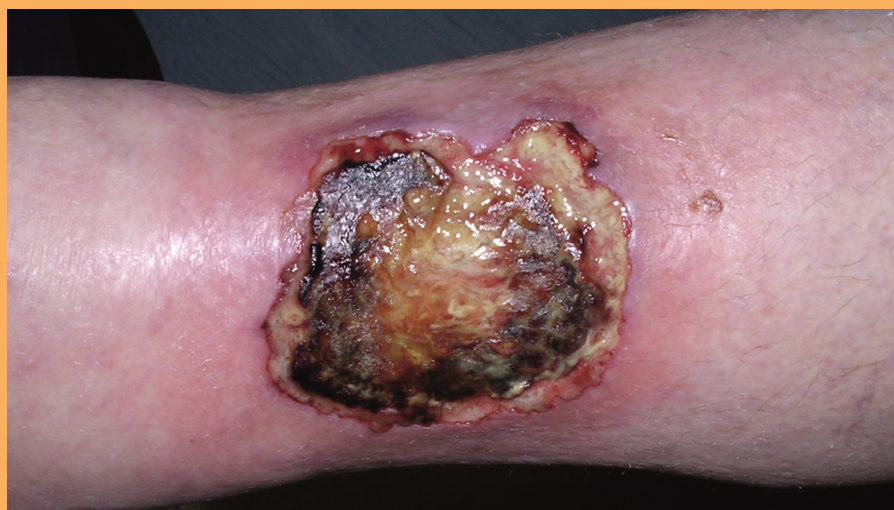
Figure 5. Pyoderma gangrenosum .