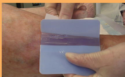
Figure 7. Remove the backing from the hydrogel sheet and place gel side down on the wound.