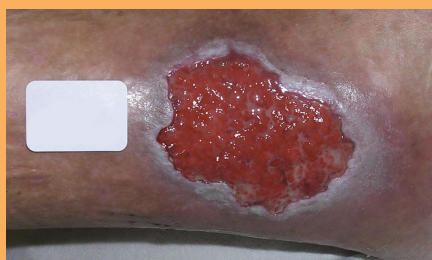
Figure 8. A clean wound bed on removal of the dressing.