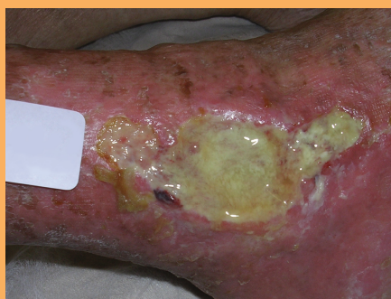
Figure 1. Sloughy tissue in a venous leg ulcer.

Necrotic tissue is generally described as black or dark brown tissue covering the wound surface and is not normally present in healing venous leg ulcers. If black necrotic tissue is present in