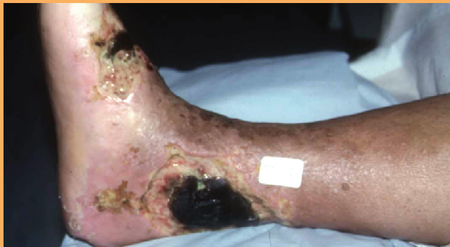
Figure 3. Necrotic tissue in ulcer with significant arterial insufficiency.

It is important to be able to recognise and describe different types of tissue and to know when to leave well alone. If in doubt specialist help should always be sought.