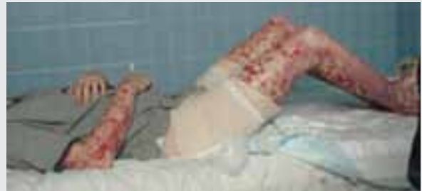
Figure 1. Patient 1 before the application of hydrogel sheet dressings.

Within hours of application of the hydrogel sheet dressing the patient reported a substantial reduction in pruritus. As a result of this he scratched the area less, and if he did scratch the dressing provided a mechanical barrier that protected the fragile skin. Healing was thereby improved in this area.