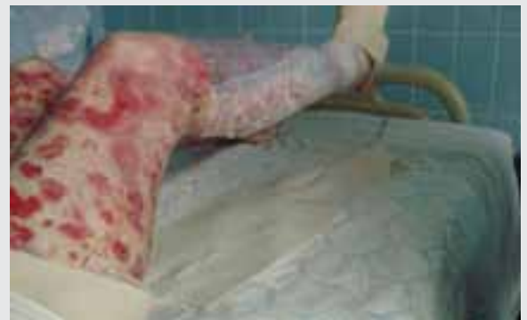
Figure 2. Patient 1 showing application of hydrogel sheet dressings.