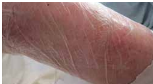
Figure 10 (right). Clingfilm is applied directly to intact skin and open wounds.