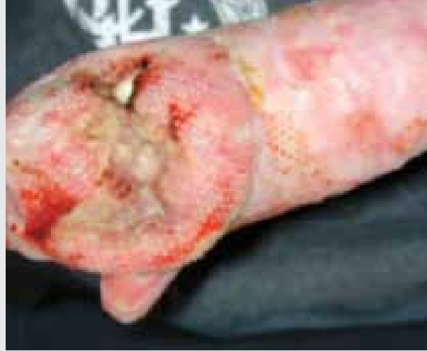
Figure 1. Fungating wound on the dorsum of the left hand three weeks after initial breaching of the skin.

Additionally patient choice plays a part, and the EB patient is frequently the final arbiter in choosing which dressings he or she will or will not use.