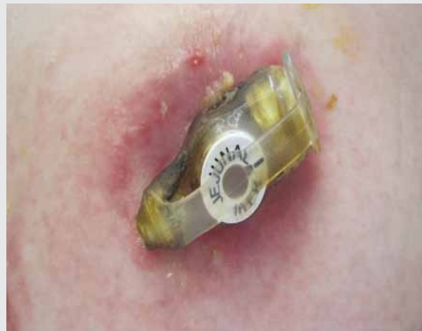
Figure 2. After one month of using superabsorbent drainage dressings.