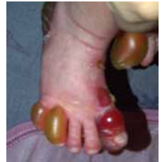
Figure 1. Blisters on toes in patient with EBS.

Some patients advocate using sterilised scissors or a scalpel blade to create a larger hole to prevent the blister from refilling. The roof should be left on the blister unless personal preference is to de-roof it to prevent refilling, but de-roofing can lead to additional pain and should be discouraged if possible.