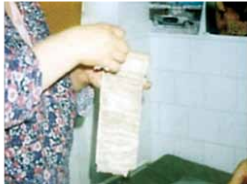
Figures 7-9 (above). Melted fat is spread onto toilet paper; the toilet paper is wrapped around skin and wounds; it is easily removed without adherence.