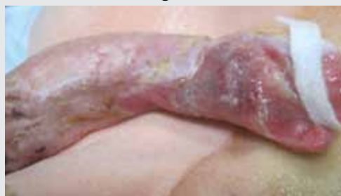
Figure 2. Strips of Hydrofiber® are placed between the toes (all toes except the great toe fused in this infant).