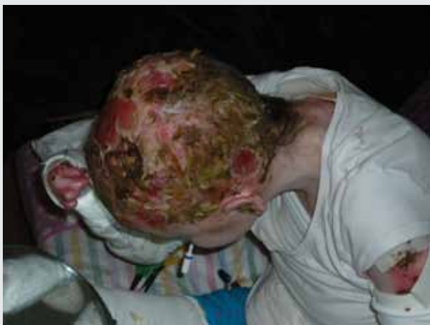
Figure 1. Wounds upon presentation.