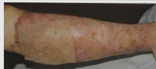
Figure 2. Eighteen months after change of dressing regimen and reduction in activity levels.