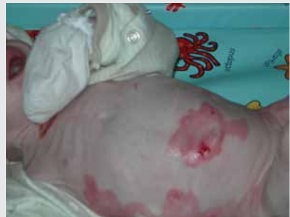
Figure 2. Patient aged six weeks after switching to a hydrogel impregnated gauze.