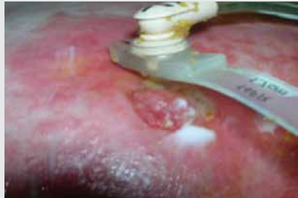
Figure 1. Gastrostomy wound before being treated with superabsorbent drainage dressings.

Leakage continued but was contained with the superabsorbent dressings. Clothing remained dry which was important to the patient. Over the course of six weeks the wound decreased in size to a 1cm x 1.5cm area beneath the gastrostomy button and the large area of excoriation healed ( Figure 2 ). Pain scoring on the Wong Baker Scale dropped from 10 to two during both dressing changes and wear time.