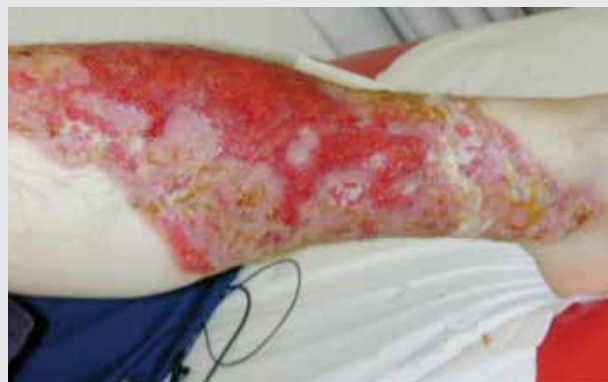
Figure 1. The patient's wound upon presentation.

The wound was washed with Octensian® (Schülke) at each dressing change to prevent infection and Dermovate™ NN (GSK) was applied to overgranulated areas for three days after which there was a reduction in hypergranulation tissue. 50/50 emollient was used to soften the hyperkeratotic areas and aid manual debridement with forceps. Urgotul® was used as a primary dressing to ascertain whether the patient was intolerant to the impurities in the soft silicone dressings he had been using. Urgotul® (Urgo) has atraumatic application and removal and can also assist in reducing overgranulation. Mepilex® Transfer (Mölnlycke Health Care) was used to ensure that exudate transferred away from the wound bed and the periwound skin to the secondary absorbent dressing. Release® (J&J) dressing was used as this was the patient's preference. The patient also made the decision to resign from his employment to focus on trying to heal this wound by ensuring rest and regular dressing changes. K-Band® and Tubifast® were used for retention. Cavilon™ (3M) was used to protect the periwound from maceration.