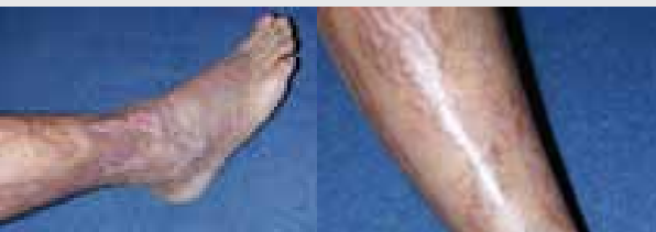
Figure 2. Patient 2 two months after commencement of treatment using sheet hydrogel dressings.