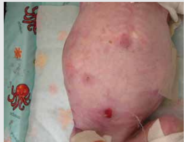
Figure 3. Aged 13 months following treatment with a lipido-colloid as a wound contact layer with a hydrogel impregnated gauze as a secondary dressing.