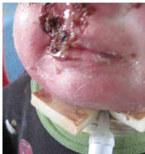
Figure 6. When using a tracheostomy tube in small infants an extension tube may be needed to prevent it rubbing under the chin.

The proximity of the tube in relation to the underside of the chin in small infants can lead to wounds on this area and an extension to the tube should be considered to avoid this ( Figure 6 ).