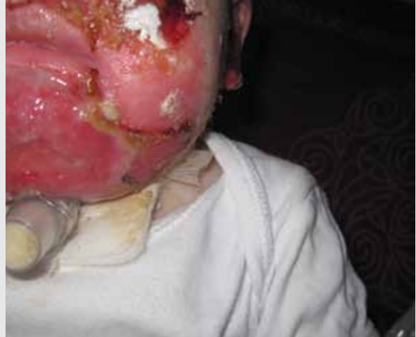
Figure 1. Aged one year. Flaminal® Forte was applied for four weeks only then Dermovate™ NN on a daily basis.

The overgranulation tissue gradually reduced and healing took place. Flaminal was applied for four weeks only then Dermovate™ NN on a daily basis. The quality of the healed skin was good and it resisted blistering. By two years of age the patient's lower face had healed ( Figure 2 ) although the top of his nose and forehead remained fragile with a tendency for the skin to break down when he rubbed these areas.