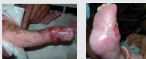
Figures 4 and 5. Patient at 48 days old using polymeric membrane dressings.

digital fusion resulted on one foot. This can occur within 24 hours of two raw surfaces being in apposition.