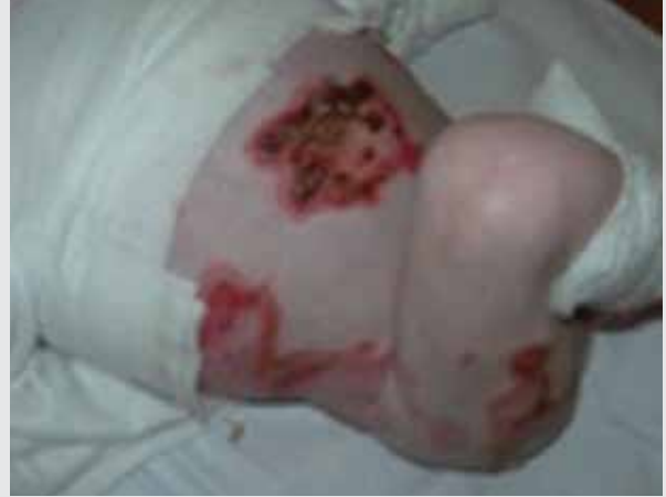
Figure 1. Patient aged three weeks using soft silicone mesh.

All lesions healed within four weeks and pain at dressing changes was reduced. The wounds remained clean. New blisters and wounds occurred only occasionally and these healed rapidly despite the progressive cachexia and breathing impairment. The infant died aged 14 months but the skin was largely intact before her death ( Figure 3 ).