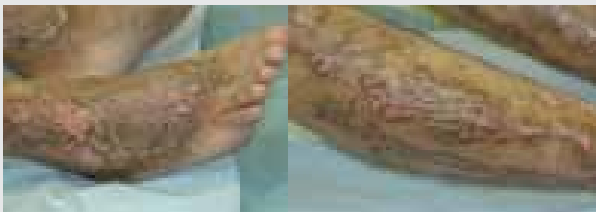
Figure 1. Patient 2 before the application of hydrogel sheet dressings.