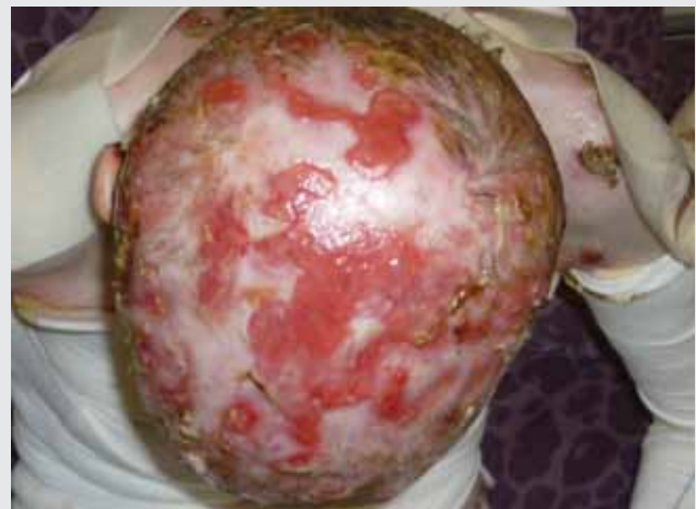
Figure 2. After four weeks of treatment with Flaminal® Hydro.